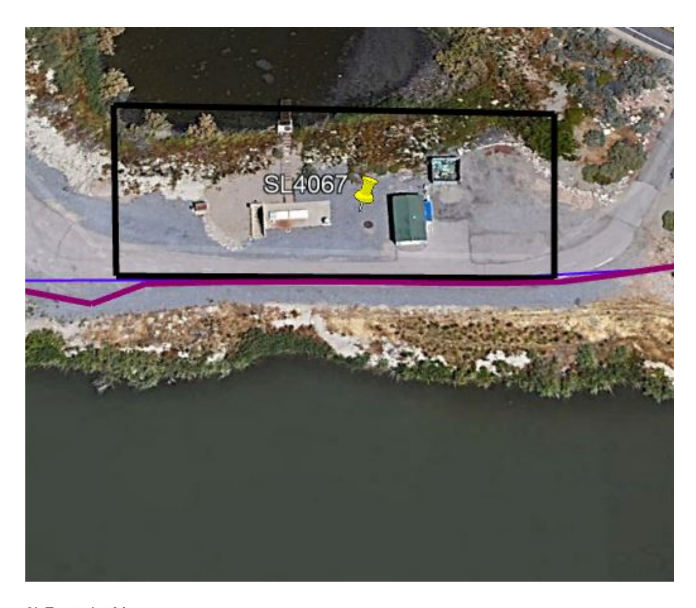
3) Footprint Map